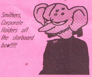
TV Show Cross-overs Daimon Burns

products, especially fresh ones, may be restricted. That's pretty much all you have to keep in mind. Average time spent dealing with border formalities for most people should be less than two minutes. Be polite and truthful to border guards. They will ask a few questions, just to see whether a traveler seems unusually nervous or shifty. In our experience, the eyes of customs officials tend to glaze over with disinterest when one says, "We're going to a science fiction convention!" and one gets waved through. When you are in Canada, keep your receipts. Canadians pay a lot of taxes, but American and other foreign visitors don't have to. Forms will be provided so that you can get a refund for all sales taxes you pay for purchases in Canada.